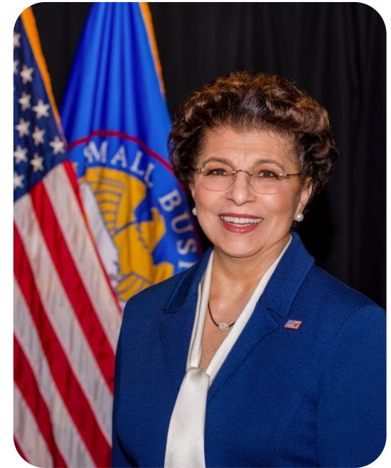
Administrator Jovita Carranza

Upon a request received from a state's or territory's Governor, SBA will issue under its own authority, as provide by the Coronavirus Preparedness and Response Supplement Appropriations Act that was recently signed by the President, an Economic Injury Disaster Loan declaration.